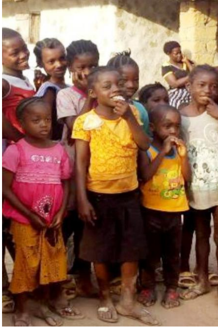
Village children living in poverty