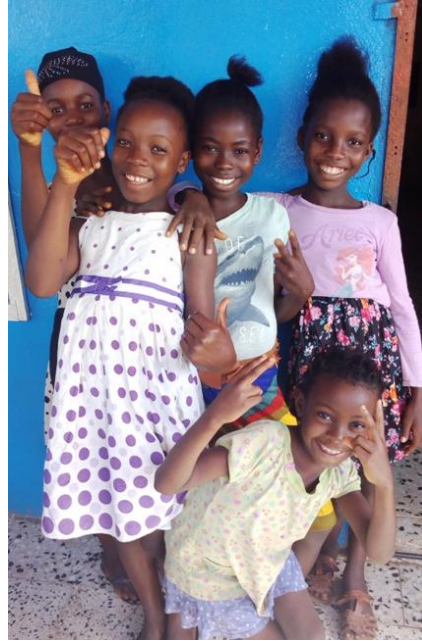
Orphanage/Humanitarian Refuge Home children living in provision

Sponsor the Needy and Ensure Their Release from Poverty and Hopelessness to “Provision and Empowerment”