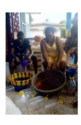
The Children Prepare for the Distribution

Every day, morning and evening prayers and praise and worship services are part of the program at SIC. A constant theme in their prayers is for help for those in the villages left behind. The reality of closed markets and counties being in quarantine limiting travel from one place to another during the COVID-19 crisis can have profound negative effects; a major concern among the orphanage residents arose about how their relatives (often frail seniors) or previous caregivers would be able to feed themselves or get basic hygiene items. So our COVID Relief program grew from a small seed of helping one frail grandma in need to helping over 45 impoverished families. An action plan was developed, an appeal made to our donors and the results were overwhelming. Among the distributed relief items were bags of rice, red oil, vegetable oil, onions, dried pepper, seasoning cubes, salt, washing power, body soap, iron soap, slippers, and to some, a financial grant. The orphanage children and young adults were very joyous, as everyone participated in the measuring and separation of items and notifying those left behind of the coming provisions. We are seeking donations for the next distribution. Will you help us...help them?