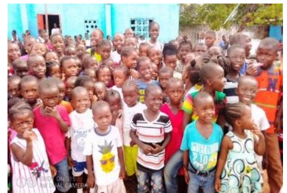
Donations Sponsor Education: Education Births Smiles and Hope for a Brighter Future