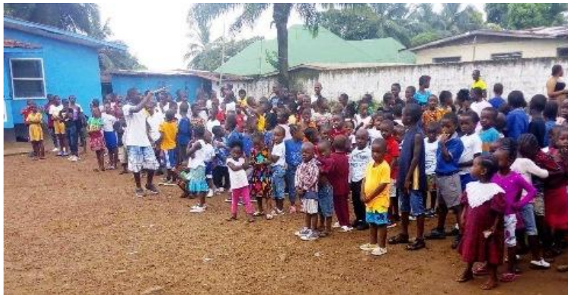
With Donor Support, Meet the New ENMA Students