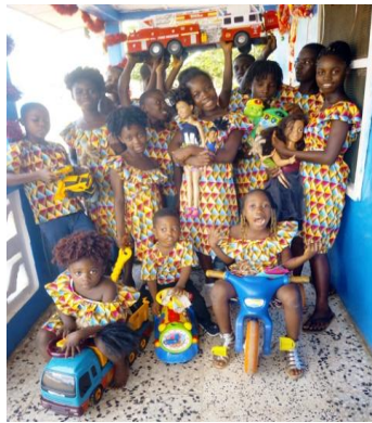
Toys, Dolls & Games