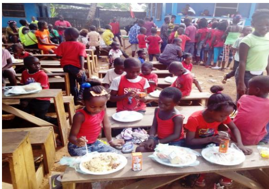
ENMA Student's Thank Donors for their Christmas Party