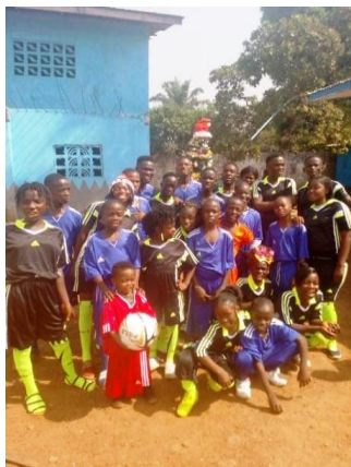
New Soccer Uniforms