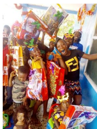
Clothes, Shoes & Money