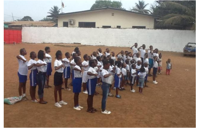
ENMA Gym Class Lines Up in their New Uniforms