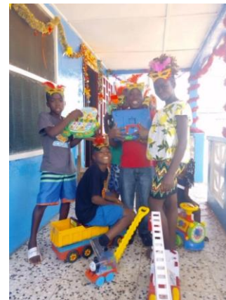
The Day after Christmas