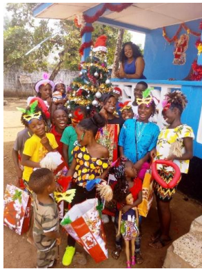
Joy & Happiness

Great Christmas Cheer and Celebrations Abound. Thank You Donors!