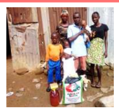
Rural Villagers Received Relief