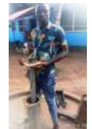
Well Pump Repair

All SIC residential buildings, bathhouse, kitchen building and the security booth received new electrical wiring, plugs, sockets and switches. The SIC buildings received a new facelift with interior and exterior painting. We are so grateful for all donors who helped us transform the quality of their lives. Thank you so much!