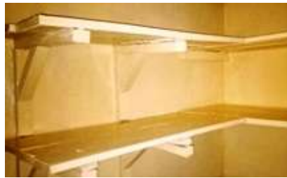
Interior Painting and Storage Shelving Throughout Compound