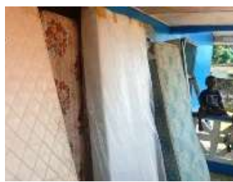
New American Mattresses