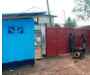
Repaired Iron Security Gate