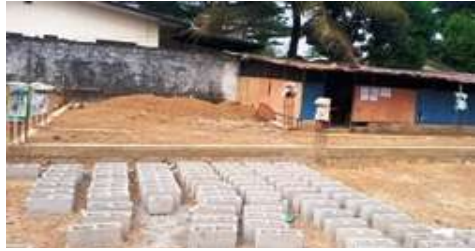
Bricks for New School Annex