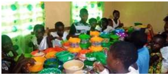
New bowls, cups and silverware for everyone

Roof Replacements on 3 buildings – The kitchen building and the porch for the main house and one- half of the ENMA school -- due to termite damage. The solar panel system had to be removed from the school and reinstalled.