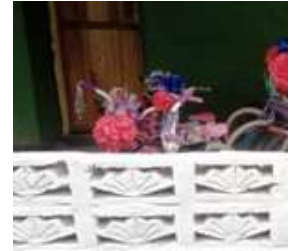
New Bicycle Porch