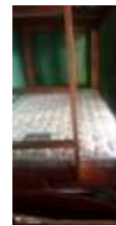
New Boys and Girls Bunk Beds